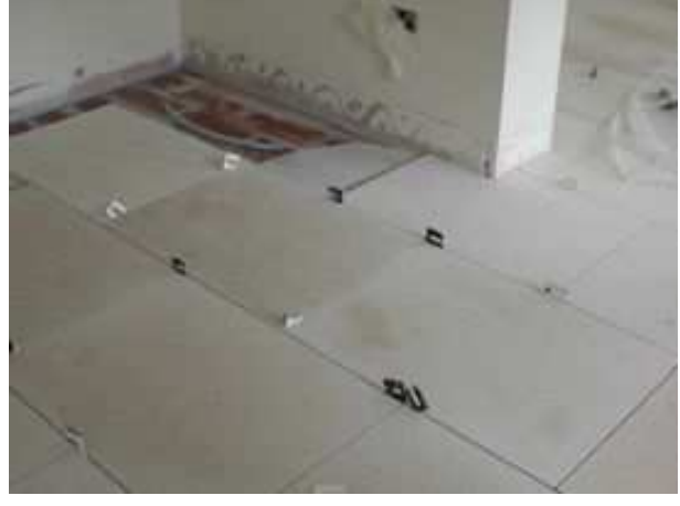
Large format 800 x 600 x 20mm limestone slabs being laid directly on the Screed Replacement Tiles