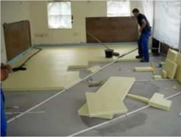
70mm ship lapped high density insulation being laid on levelled substrate.

Berkeley Homes commissioned Jupiter to replace a malfunctioning screed underfloor heating system. With the first attempt the natural limestone slabs had cracked in many places due to various reasons. Independent consultants as well as the British Stone Federation approved the use of the Screed Replacement Tile (S.R.T.) as a reliable substrate to the limestone. Being completely inert, the S.R.T. system does not expand and contract when heated and works with Floor finishes rather than against. Up to 400 m 2 of S.R.T. can be laid with out any expansion joints and natural stone products up to 1000 x 15mm (minimum) are approved on them.