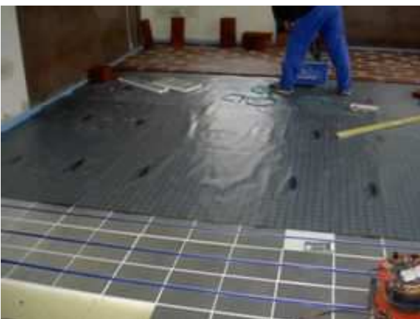
20mm Screed Replacement Tiles are glued together on a foil which prevents the tile glue coming in contact with the heating system.