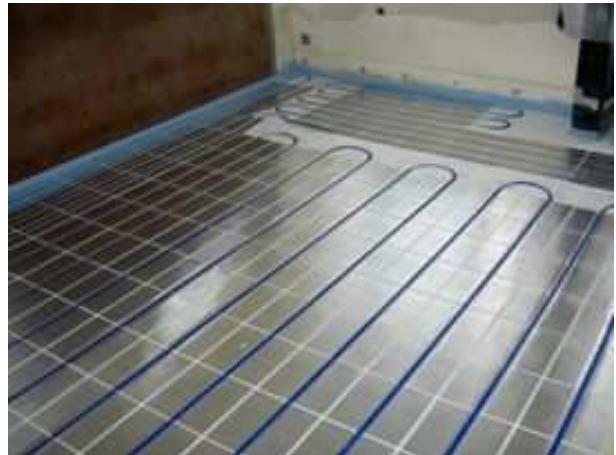
Once in position, pipes are clipped into the tracked panels.