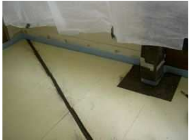
Channels left where insulation is installed up to conduits are filled with pulverised slate ensuring channels remain full and stable